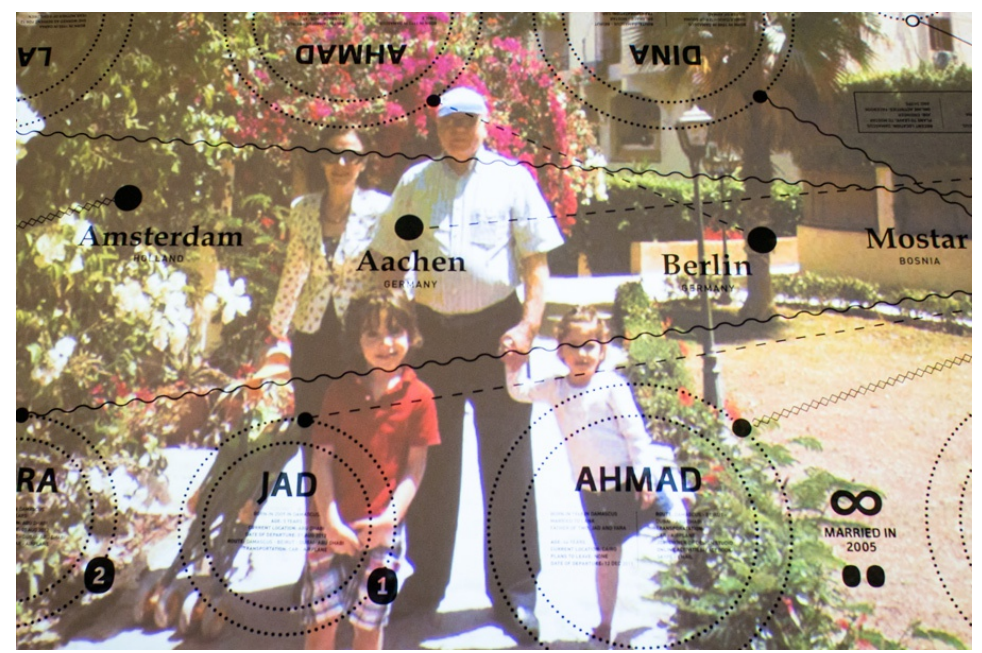
Foundland, Friday Table , 2013-14, video projection on installation detail. Escape Routes and Waiting Rooms . Installation shots. July 30 – September 26, 2014. ISCP, New York.

FL : We use the tent as a metaphoric placeholder, standing for displacement and the state of finding oneself in between. We are concerned with the fluctuating state that exists between being involuntarily displaced from a life that you once knew, and having to deal with constructing a new reality. All over the world today people are being relocated to 'temporary' camps and dwellings, until with time, these places become integrated into the surrounding urban structures and in some cases develop into cities. The tent installation functions as a house or urban plan in motion, rather than a slice of the past or a memorial as in Emily Jacir's work. We do see similarities with her work in our desire to collect and archive. However, the house drawings that we collect from Syrians are subjective stories.