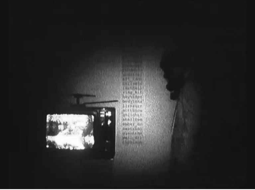
Roy Samaha, still from Untitled for Several Reasons , 2003. 12 minutes, SD video.