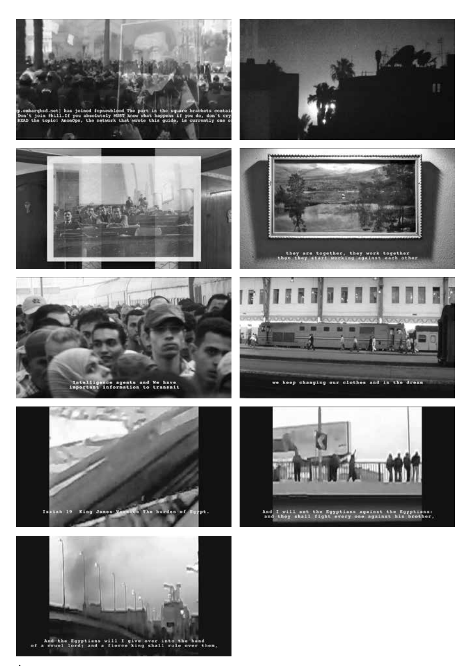
A Roy Samaha, still from Transparent Evil , 2011. 27 minutes, HD video.