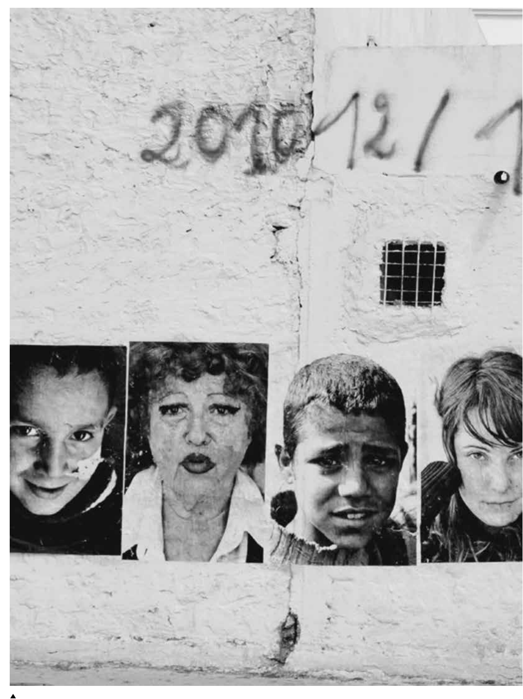
▲ Héla Ammar, Revolution , 2011.