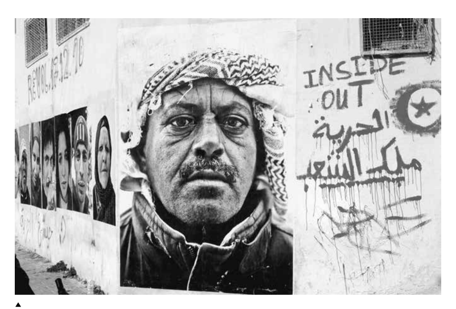
A Héla Ammar, la liberté appartient au peuple: Freedom Belongs to the People, 2011.