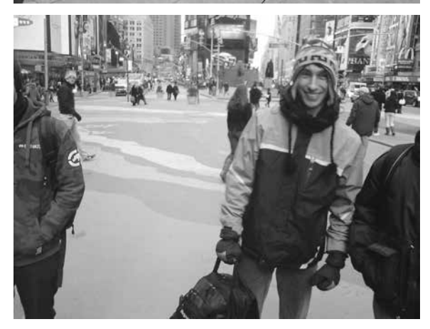
▲ Wafaa Bilal, 3rdi , year-long performance, 2010–11.