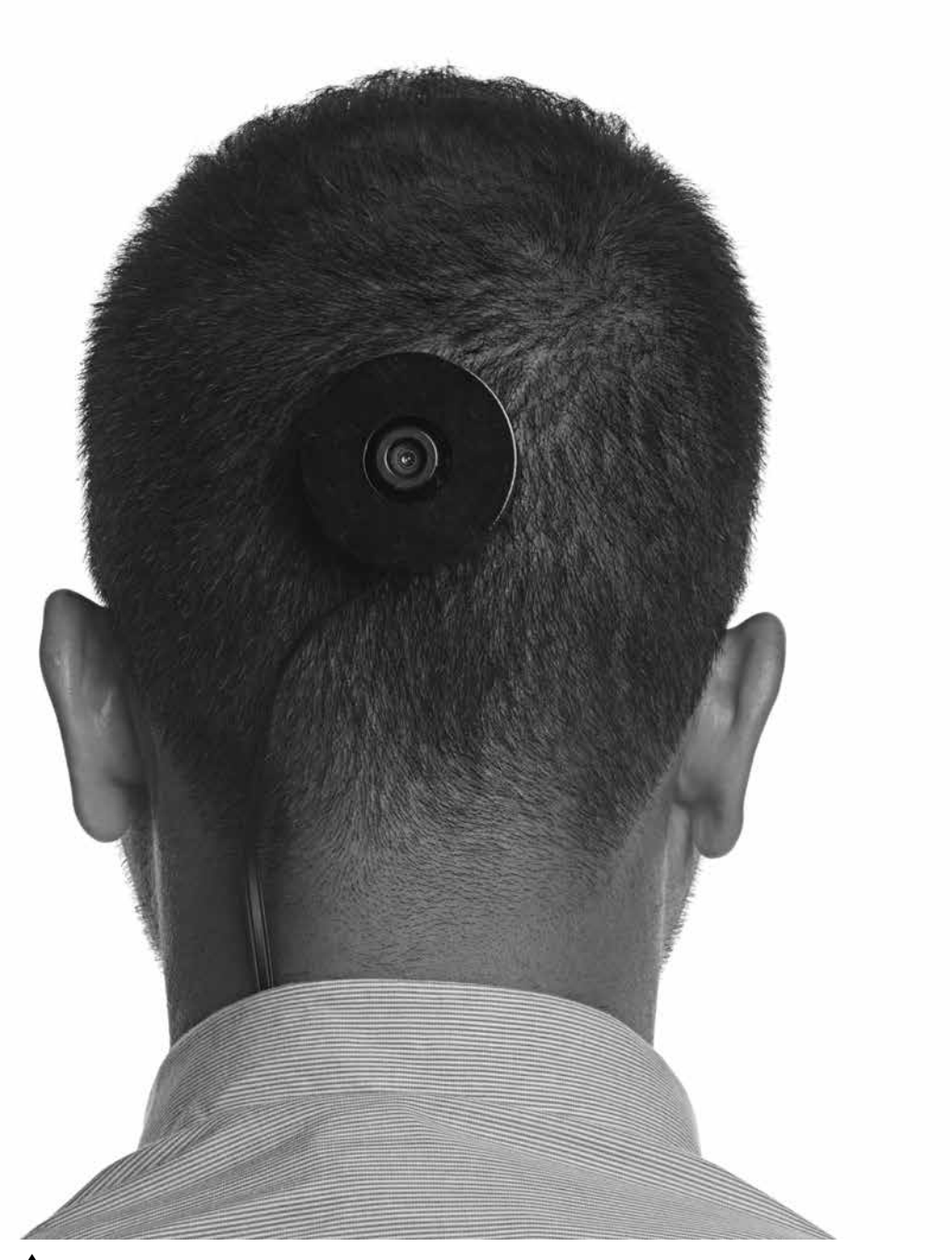
▲ Wafaa Bilal, 3rdi , year-long performance, 2010–2011.