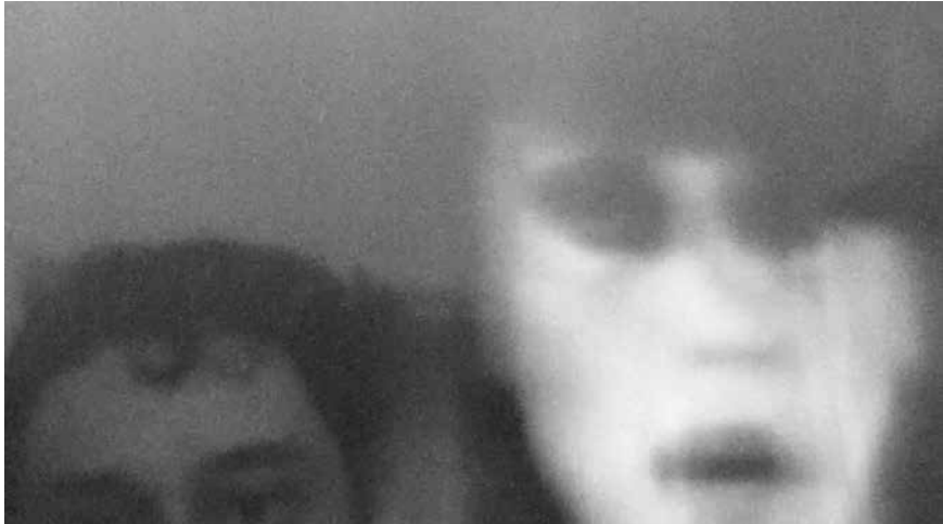
▲ ► Roy Dib, Objects in Mirror Are Closer Than They Appear , 2012.