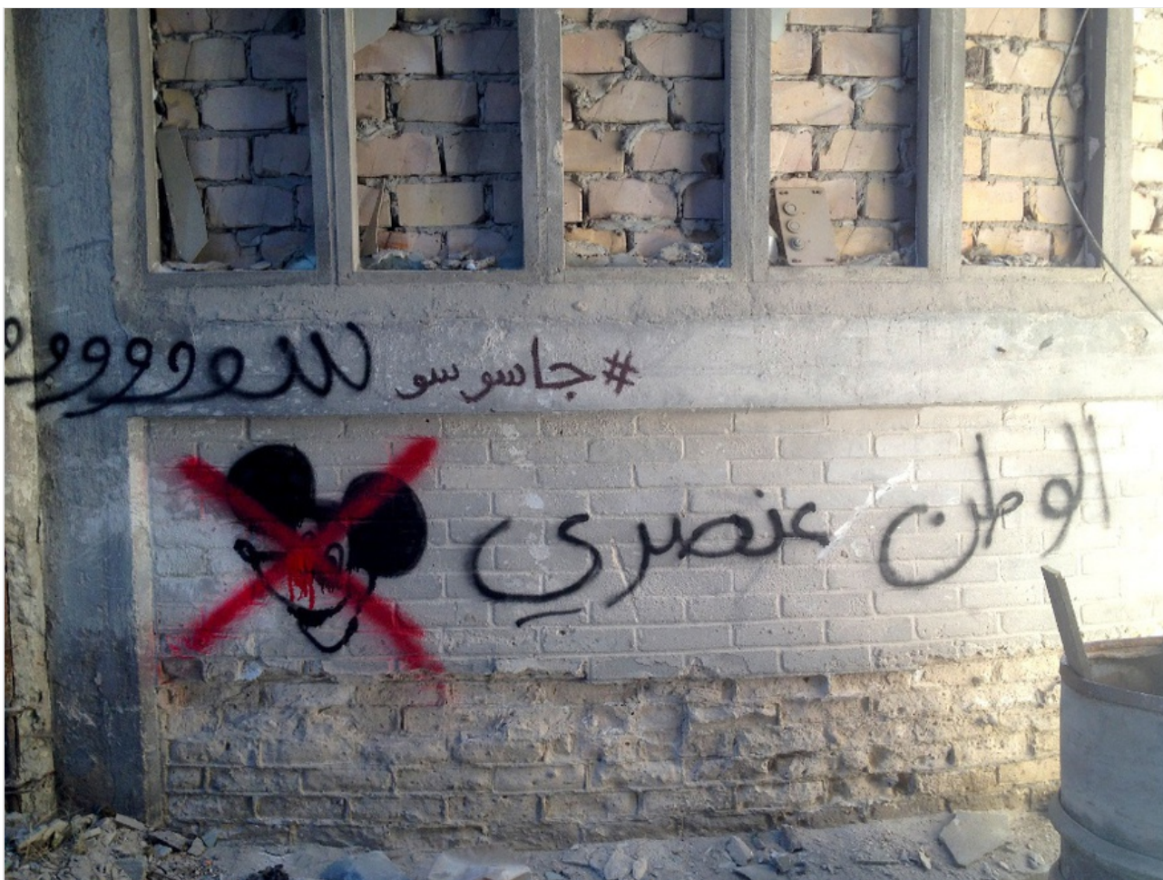
Arabian Street Artists, Homeland is racist.

Many are starting by reclaiming their narratives abroad and addressing the complex relationships between dictators that impose systems of oppression and the military industrial complex that enables them. Activists from London Palestine Action , for example, posted 'subvertisements' (subversive advertisements) in London's underground tube network critiquing Israel's apartheid policies. In a statement the activists claim 'Israel and its supporters are used to having the mainstream media repeat their talking points. Our action's aim is to shine a spotlight on the support that Israel receives from the UK government and arms industry and UK companies like G4S as well as the one sided reporting which is endemic in the BBC'.[16] Their project attempts to alter local politics by speaking to foreign players. Considered as a form of culture activism, the subvertisements shed light on the impact of globalisation and neo-liberalism on local politics.