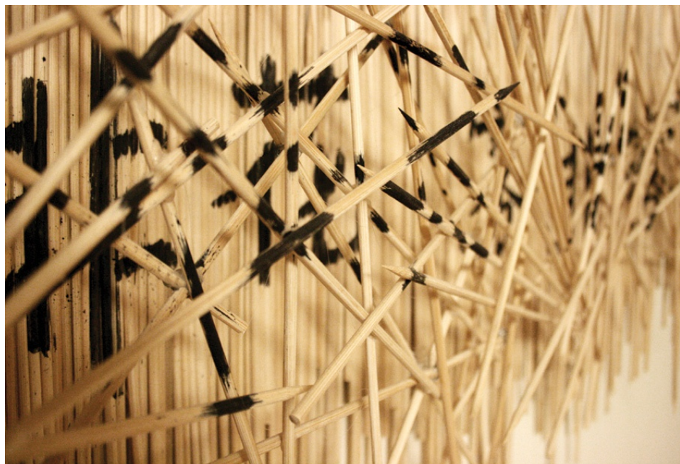
Sharjah Calligraphy Biennial.