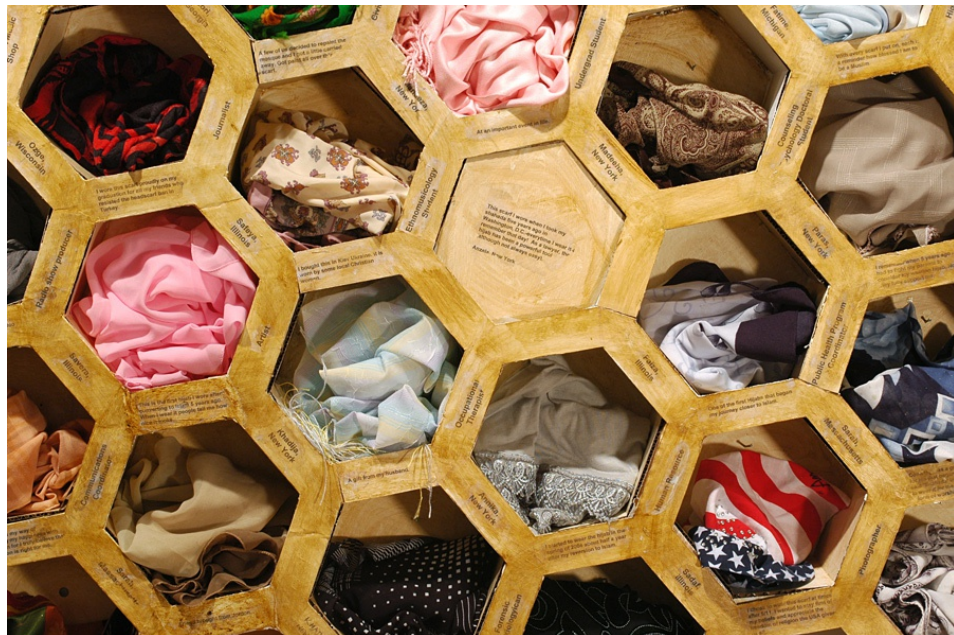
Islamic Arts Festival, Sharjah.

HAM: Sometimes I am fighting with myself. If you want to build culture it should come from your earth – you should not bring the project from outside. Culture should come from the perspective of society. We might produce something different, but that is OK. Recently, we have been given approval to conduct workshops in the mosques, things like calligraphy workshops, which are then made accessible to the local population.