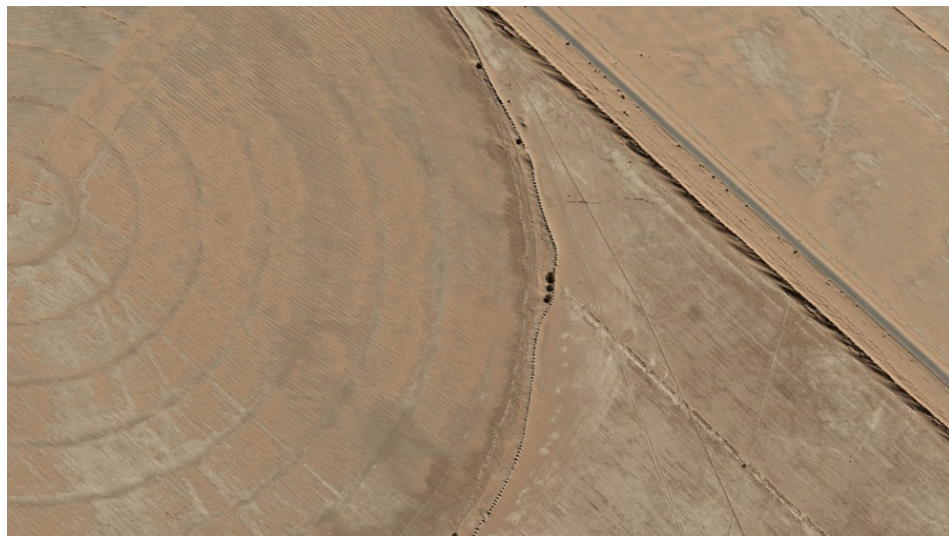
Jannane Al-Ani, Shadow Sites I (2010). Digitized super 16 mm film, 14'20".

Jannane Al-Ani in conversation with Nat Muller