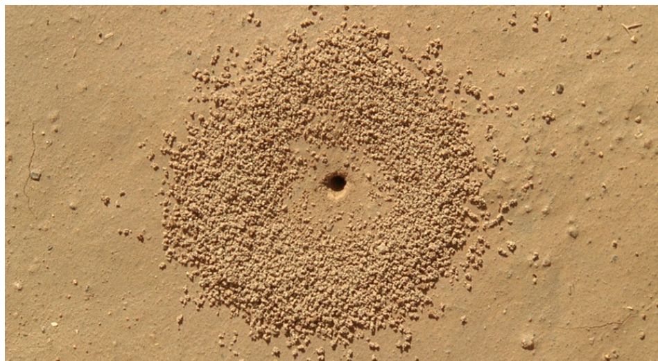
Jananne Al-Ani, Excavators (2010). Digitized Super 16 mm film, 2'24".

Showing Groundworks alongside the Shadow Sites films was a way to link signs of ancient and contemporary activities in the landscape and to pull the American and Middle Eastern territories closer together, both literally and metaphorically. I am currently working on the outstanding element in the triangle of geopolitical relationships I've been exploring in the Aesthetics project, which will focus on the British landscape.