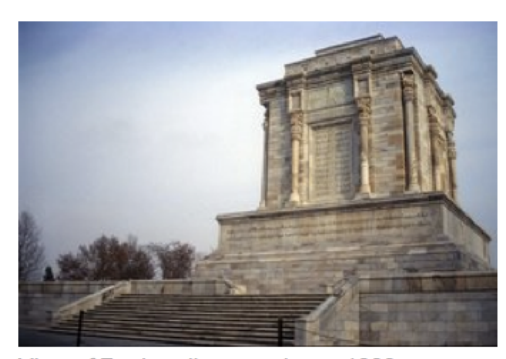
View of Ferdowsi's mausoleum, 1999

An important example is the designing of the mausoleum of Ferdowsi, the poet and author of the tenth-century national epic, the Shahnameh (book of kings in Farsi), to celebrate Ferdowsi's millenary anniversary in 1934. The building functions as a booster of national pride based on the Shahnameh 's representation of ancient Iran. Ferdowsi's tomb was initially designed by French architect and archaeologist André Godard (1924-34) in Tus and became known as Ferdowsiyeh with its distinctive pre-Islamic design and Zoroastrian ornamentation. Ferdowsiyeh contributed to fabricating a sense of modernism by