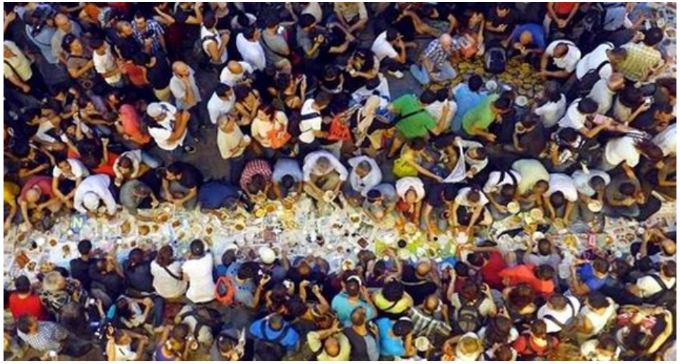
Found image: Earth Table.

Since the Abu Dhabi Guggenheim and Biennale of Sydney boycotts/threats were relatively successful, I would like to touch upon two problems this success raises and roughly present the political language these boycotts resurrect and the forms of subjectivity they activate.