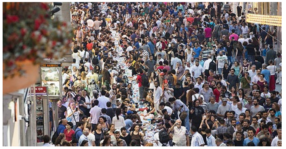
Found image: Earth Table.

In short, how should we manage the 'trade of ethics' that we conduct by means of the art world and our representative position within that? This question alone manifests the sort of political language and position of subject the boycott tactic engenders.