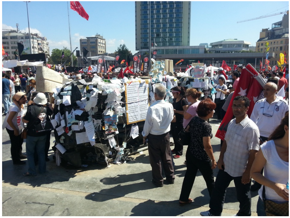
Police Car Turned to Announcement Board.

Did a new kind of art emerge after Gezi? It could be argued that the political discourses and styles in the sphere of art in Istanbul had foreshadowed Gezi before it had begun, given how the art world here generally exists outside of the prevalent political discourses and norms in Turkey. Indeed, artists shared much with the Gezi mindset: humouristic,