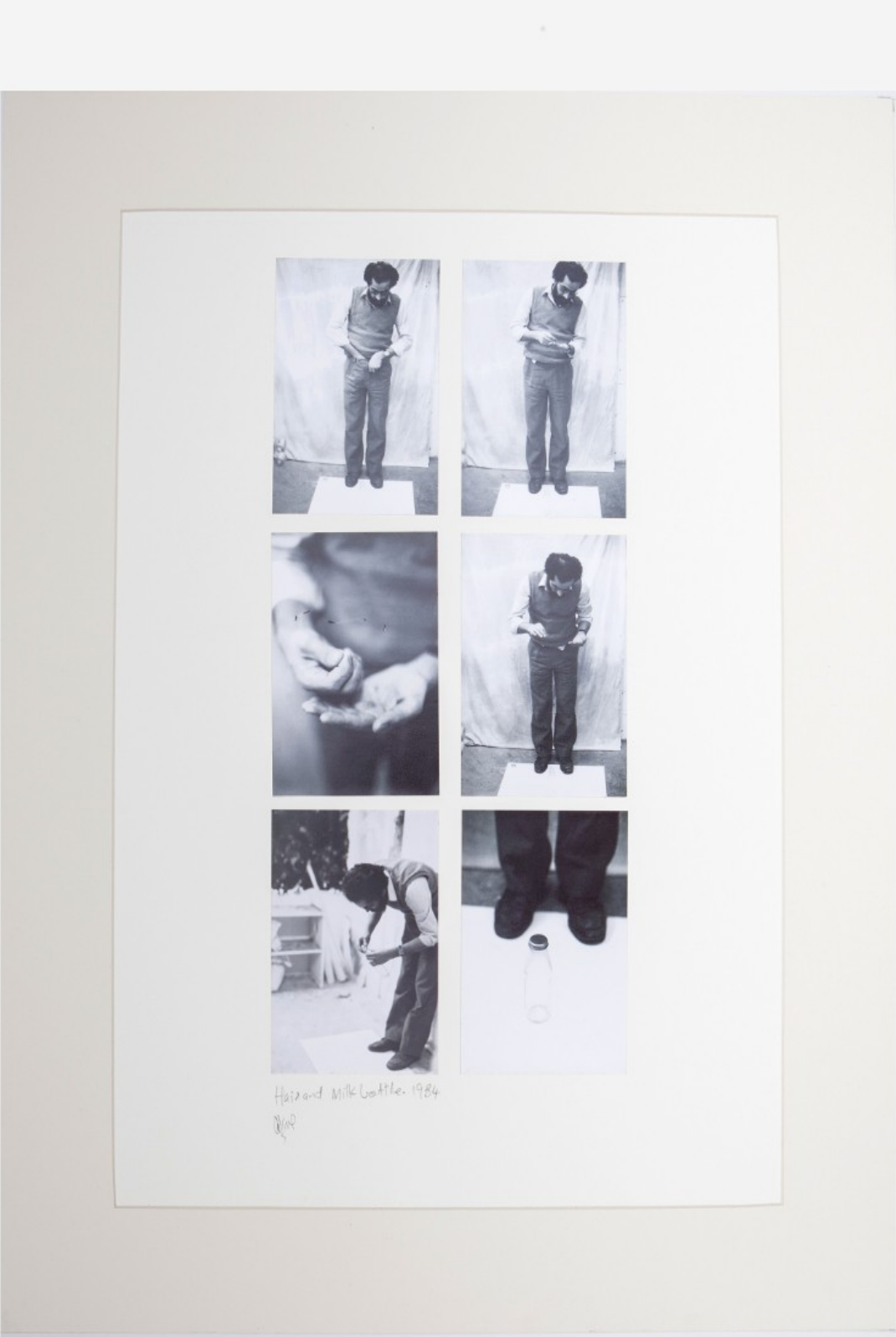
Hair and Milk Bottle, 1984 HSS