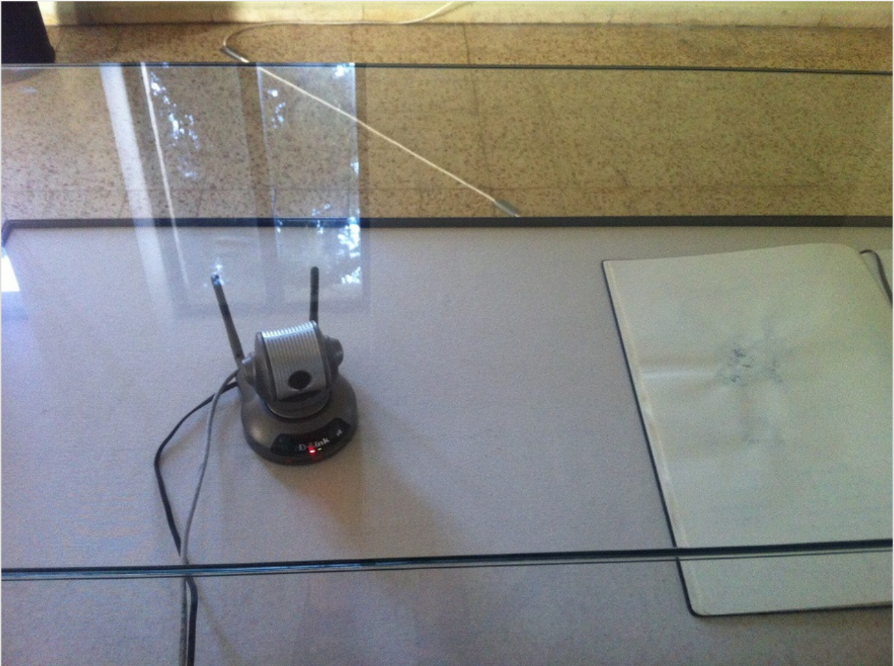
Continuity, Research Performance, 2012 Birzeit University.