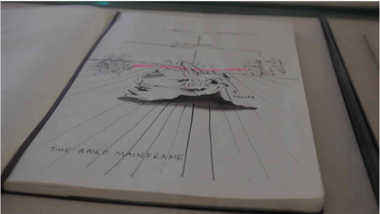
Syncing Prosthetic Devices Sketch, 2012.