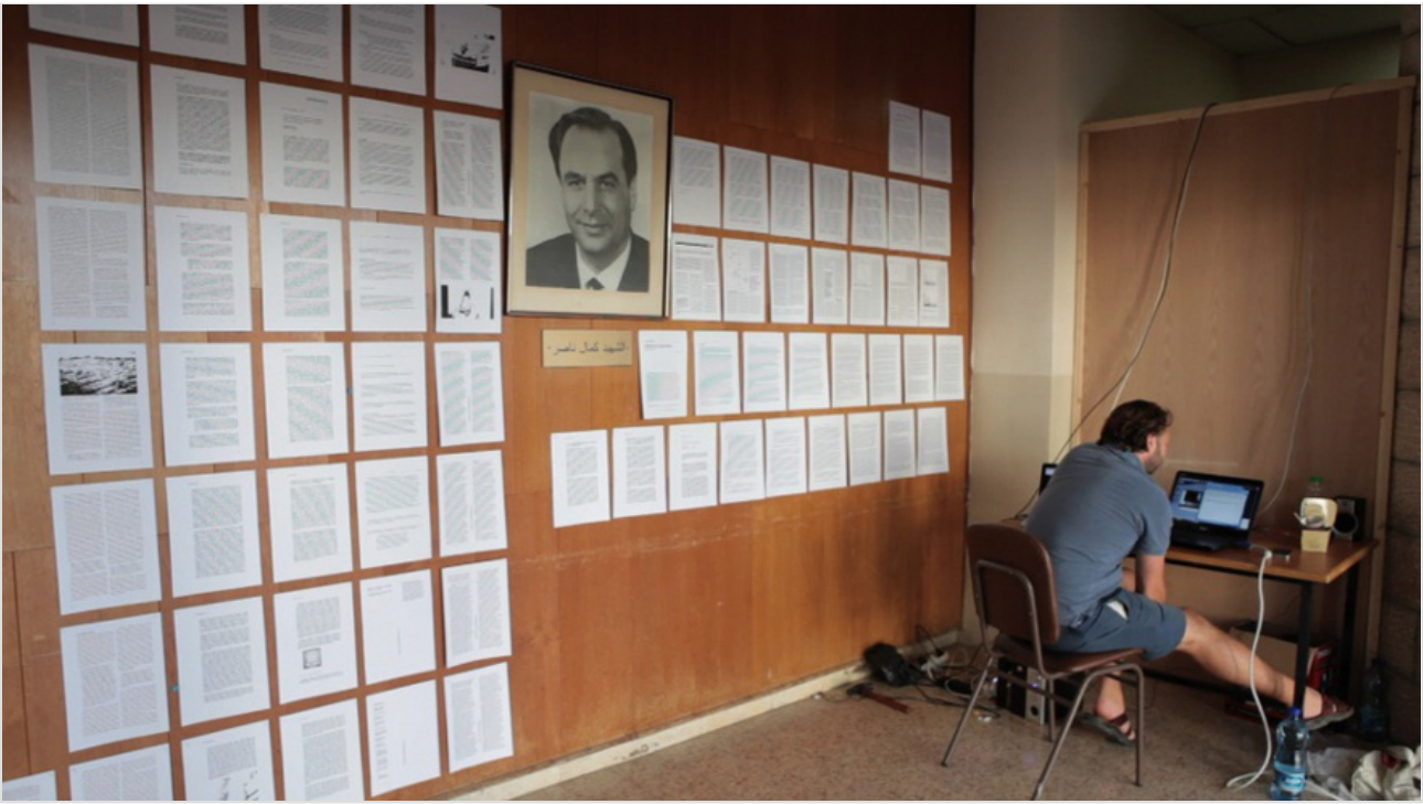
Continuity, Research Performance, 2012, Birzeit University.

duties as an amulet and a superstitious object and image, which has always interested me; the ways in which an image can be reified, due to the way in which superstition grips our imagination.