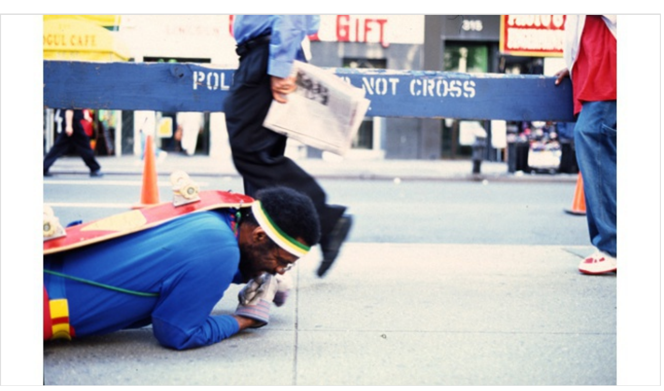
William Pope L., The Great White Way, 22 miles, 9 years, 1 street, 1990.