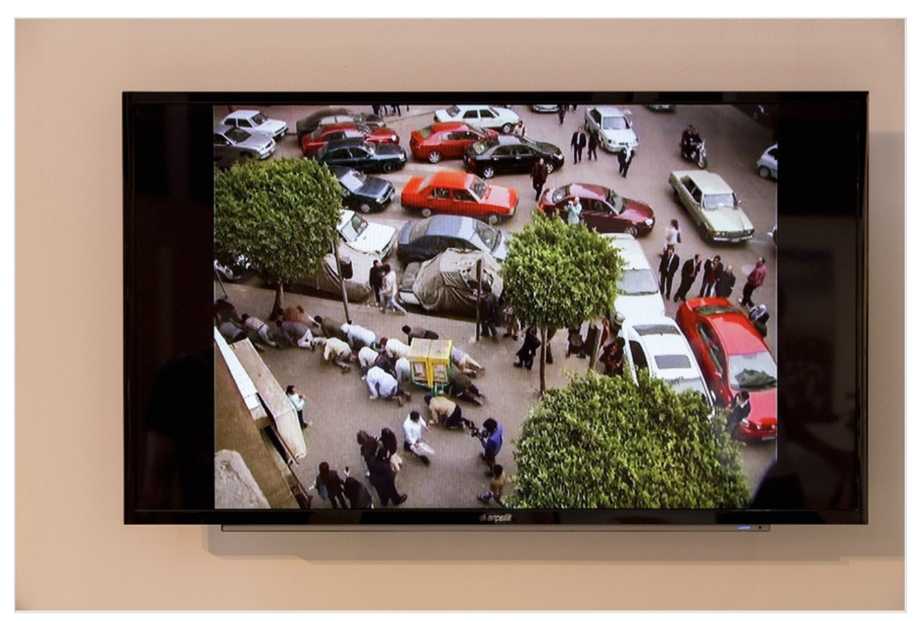
Amal Kenawy, Silence of the Lambs/Sheep , 2009. Installation view at the 13th Istanbul Biennial, 2013. Performance and video transferred to DVD, PAL, 4:3, 8:51 min.

Since then, Silence of the Sheep has been exhibited as a single channel video installation in many international biennial exhibitions and museum shows. Now baring aesthetic resemblance to the iconic images and sounds of resistance that emerged out of the 25 January Egyptian Uprisings in 2011, the work was quickly embraced and celebrated within a renewed interest in 'protest art'. Yet, while the personal contextualization of Silence of the Sheep allowed for the work to resurface in some form in Cairo, it also managed to escape some of the critical questions that emerged from the artistic conception and execution of the work: the aloofness to nuances of class and gender which was later misbranded within the art world as forms of feminism and activism. In other words, what was lost was a discussion surrounding the discrepancies between 'bringing art to the street' instead of art being part of the street.