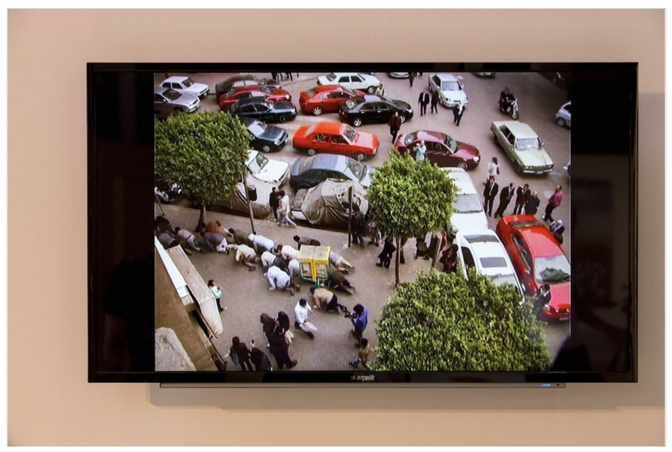
Amal Kenawy, Silence of the Lambs/Sheep, 2009. Installation view at the 13th Istanbul Biennial, 2013. Performance and video transferred to DVD, PAL, 4:3, 8:51 min.