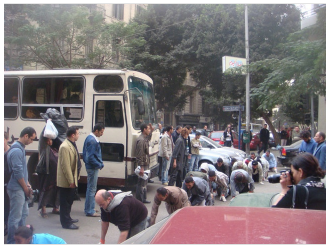
Amal Kenawy, Silence of the Lambs/Sheep, 2009. Installation view at the 13th Istanbul Biennial, 2013. Performance and video transferred to DVD, PAL, 4:3, 8:51 min.

radically different incentives for participating in the work.