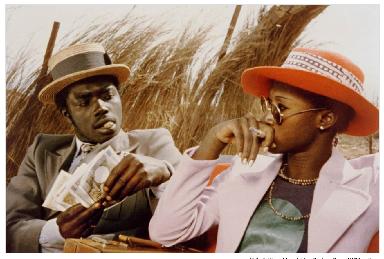
Djibril Diop Mambéty, Badou Boy, 1970. Film.

The weightedness of lagging behind in terms of material development was compensated with years of thinking content and ideas about living conditions. I divided my exhibition in chapters, like an essay, but in various locations and I explored ideas that range from investigating eras of decolonization, to recycling matter, thinking about preservation of matter versus lives, conditions of labor, redistribution of wealth and hierarchies, politics of gender and queerness, and resistance through the production of knowledge. The most important aspect for me in the above was to stay loyal to the artists and their works; ultimately they are looking at ways to better our living conditions through criticality, poetics, politics and the aesthetic and I wanted to demonstrate that. I navigated the above, as an art historian but ultimately I succumbed to my inner artist and let intuition navigate the choices and eclecticism you experience in the show that narrate the way I view the world – with a lot of positivity!