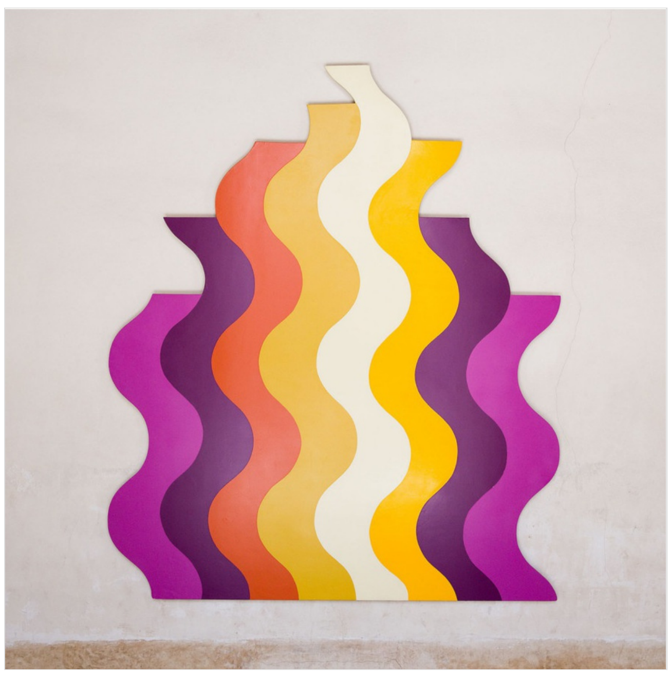
Mohammed Melehi, La Flamme , 1970, mixed media, 210 x 180cm. Copyright the artist. Courtesy Marrakech Biennale 6.

this, Fadda has conceived of a site-specific exhibition, using Marrakech and its multiple locations as the framework, to put together this timely exhibition, which not onlyasks that we rethink the term contemporary but also attempts to set in motion a curatorial concept that is in service of the regional location, and the artworks and the histories they invoke, reinstating art's agency to reframe ideas and be a site for action, now.