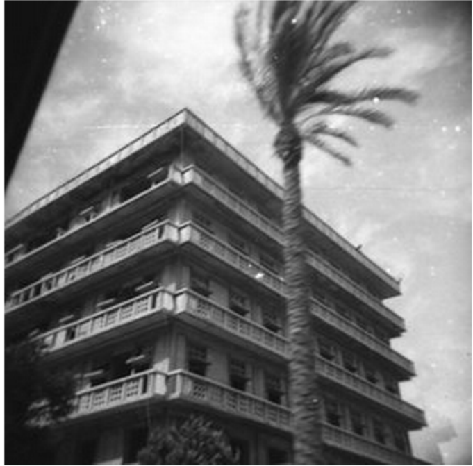
The Saint Georges Hotel, Ain el-Mseiseh, built in 1950, 2009, from the project Beirut Bereft , a collaboration between writer Rasha Salti and photographer Ziad Antar.

In Beirut Bereft , there are two images in particular that seem out of place with the others. They are both black and white and, for many, would appear to be 'poor' quality images, blurred as they are and full of imperfections. These images were taken using a Holga camera, the latter being renowned for the way it distorts and blurs film via light leaks and other inherent defects in this mass-produced piece of equipment.[7] One of these images is of the St. George Hotel and the other is of the Murr Tower mentioned above. The St. George, an elegant and somewhat incongruous (today at least) tableau of late-colonial architecture, was built in 1932 and largely gutted during the Civil War. From October 1975 until March 1976, a full-scale battle took place in and around the St. George in the Minet el Hosn hotel district of downtown Beirut, which would later become known as 'The Battle of the Hotels'. The building now stands forlorn-looking in the heart of Beirut's Corniche, which makes it a prime piece of property and therefore ripe for redevelopment. [8]