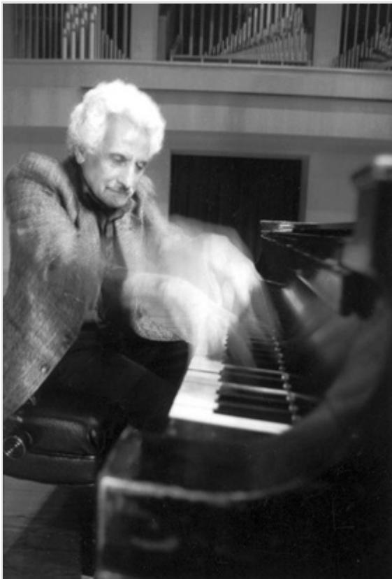
Halim El Dabh performs on the piano.