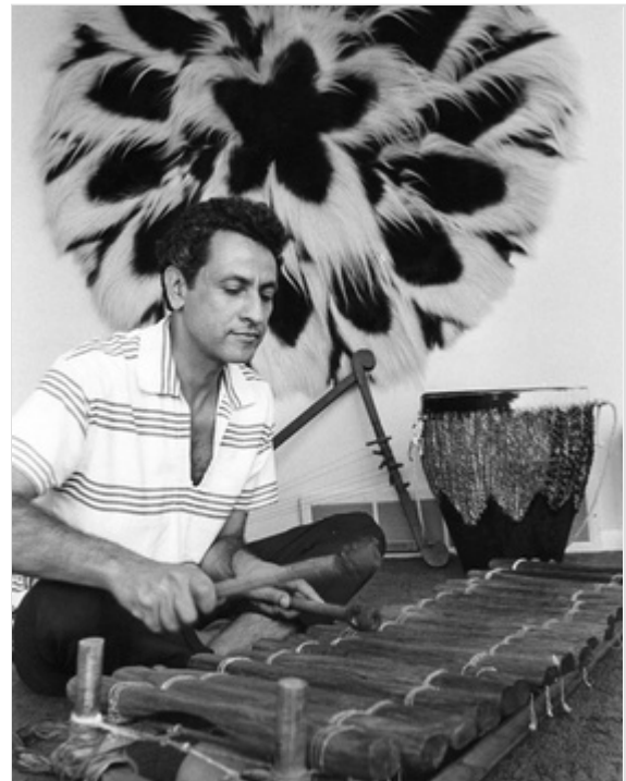
Halim El Dabh and a balafon.

The first presentation of El Dabh's works was held at All Saints Cathedral in Cairo in 1949, and included the very timely 1948 piece based on the war in Palestine, It is Dark and Damp on the Front . [25] At the time, Egyptian soldiers were involved in the fighting, and this experimental solo piece for piano resonated with the multinational and local audiences that heard it. After this performance, the US embassy cultural attaché asked El Dabh to repeat aspects of it at the Oriental Hall of the American University in Cairo. The attaché was so impressed with El Dabh that he even filled in El Dabh's Fulbright application, and despite failing the English part of the exam, El Dabh was selected from over 500 other applicants. He arrived in the USA in 1950, where he continued to experiment with tape and composition.