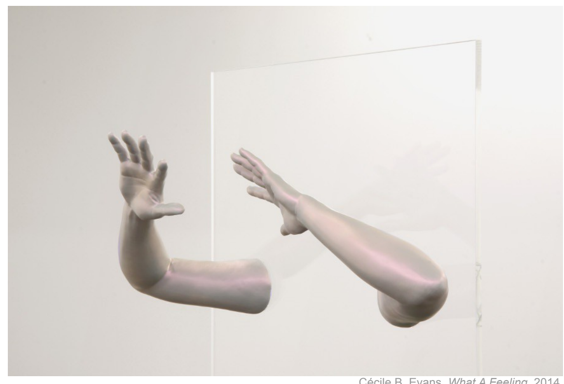
Cécile B. Evans, What A Feeling , 2014.