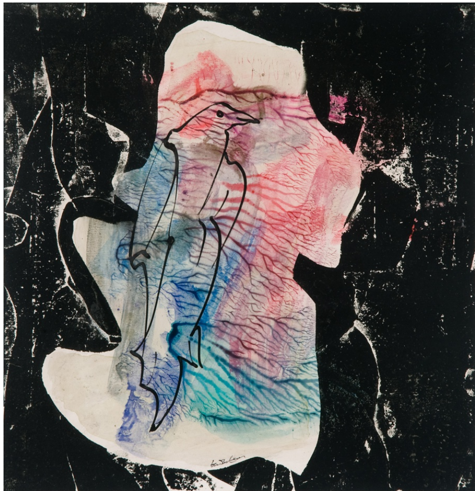
Abdallah Benanteur, Portrait de l'Oiseau-Qui-N'Existe-Pas , 2004. Mixed media on cardboard, 30 x 28 cm. Copyright Abdallah Benanteur. Courtesy Galerie Claude Lemand, Paris.