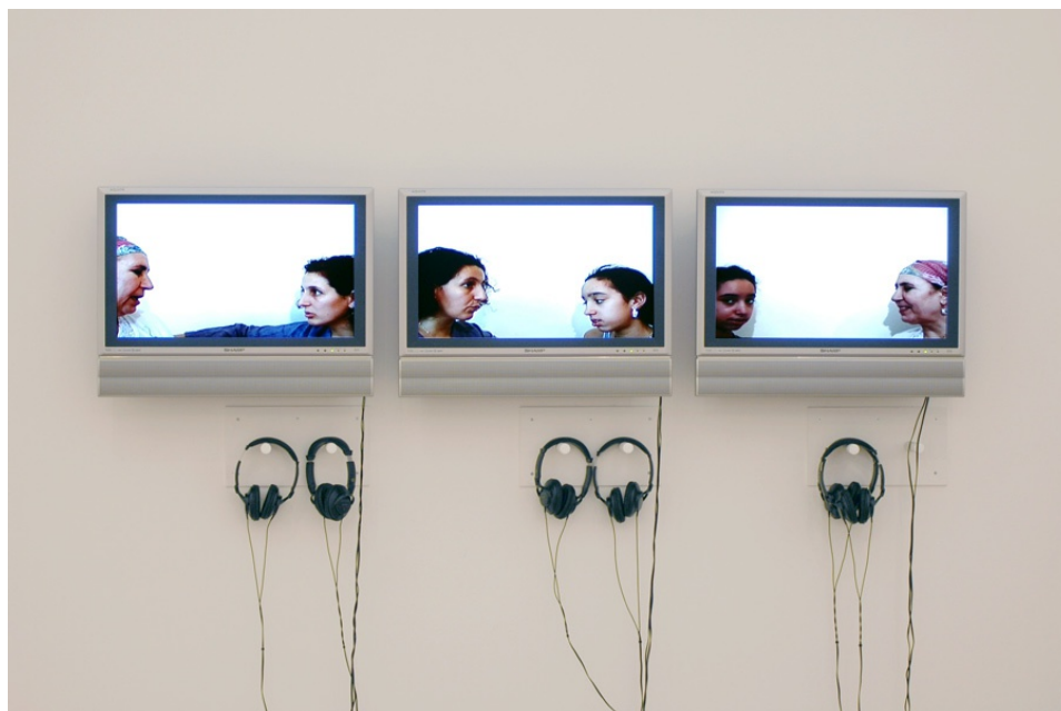
Zineb Sedira, Mother Tongue , 2002. Video (color, sound) with audio headset. Format 4/3. Exhibition view Les rêves n'ont pas de titre (mac), musée d'art contemporain, Marseille, France. 4 min 38 s (each vidéo)

Berlin-based artist Kader Attia, whose work was shown at the Barjeel Art Foundation in 2011 in Sharjah, tackles themes such 'the complex relationship between East and West and how this has played out in Europe and its immigrant communities'. [37] Adel Abdessemed's infamous statue of legendary Algerian footballer Zenidine Zidane head-butting another player during the 2006 World Cup briefly went on display on Doha's corniche before being removed following online complaints from the native population of Qatar, who saw it as offensive to religious sensitivities. [38]