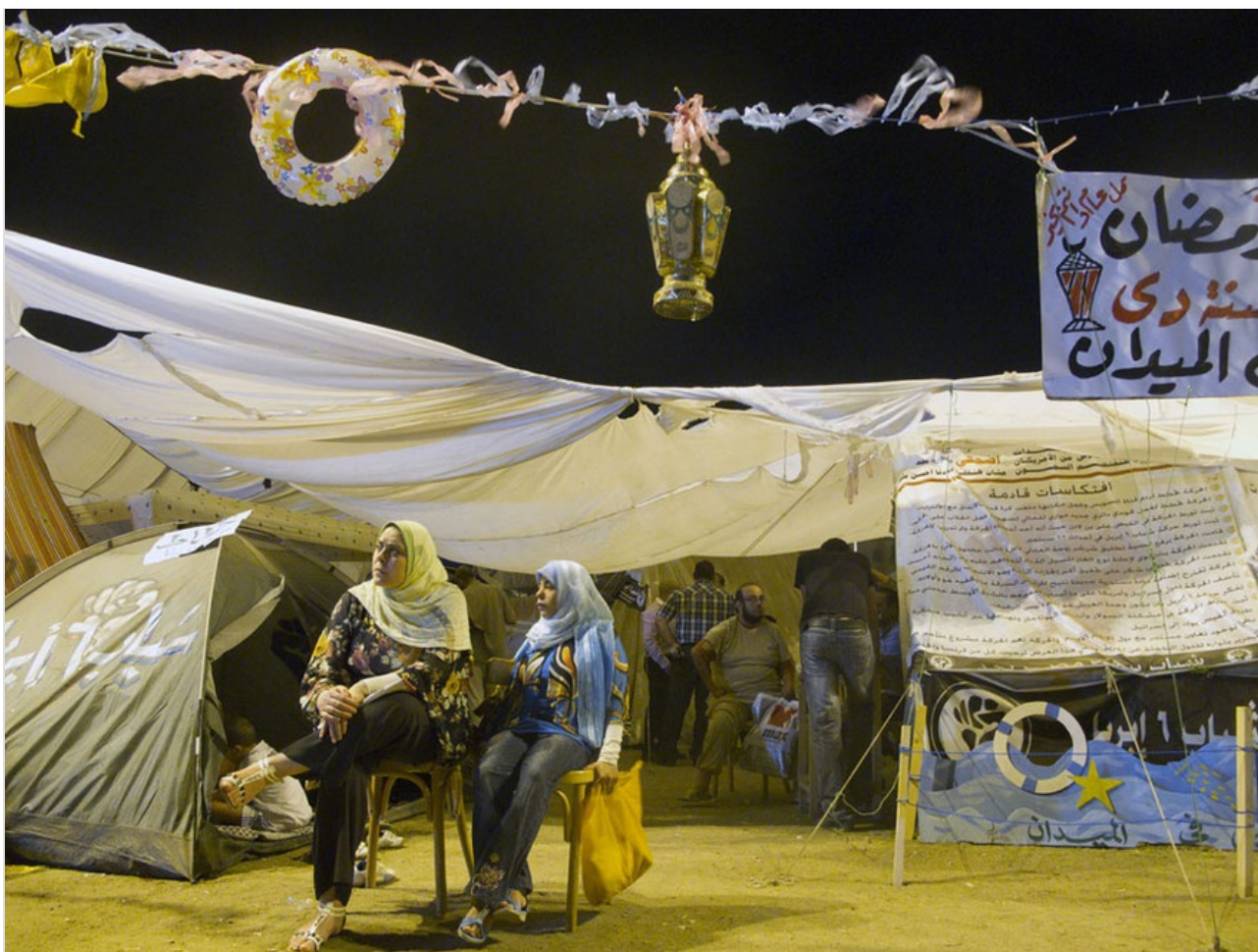
Tahrir square, July sit-in, Cairo, Egypt, 2011.

Tahrir Cinema was the first project that emerged from the Vox Populi archive. I co-founded it with non-profit Egyptian media collective Mosireen[6] (Mosireen means 'determined' in Arabic) to offer a space to screen and view archival footage by various groups. The Cinema emerged out of the 2011 summer sit-in on Tahrir, during which people took to the square and erected tents for the second time in six months. A huge piece of cloth was stretched above to protect them from the summer heat; the warm evening breeze inflated and deflated the cloth as it hovered above like a giant oyster. This oyster was the lung of the square; a lifebuoy next to a revolution banner at the entrance to one of the tents, which marked that summer as 'Tahrir Plage.'