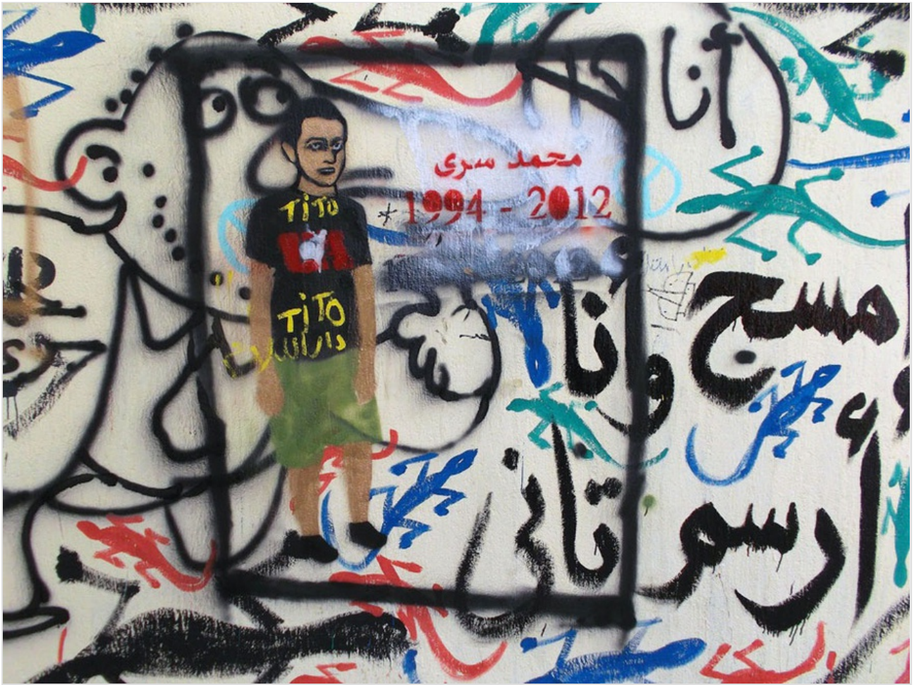
Tahrir square, Cairo, Egypt, 2014.