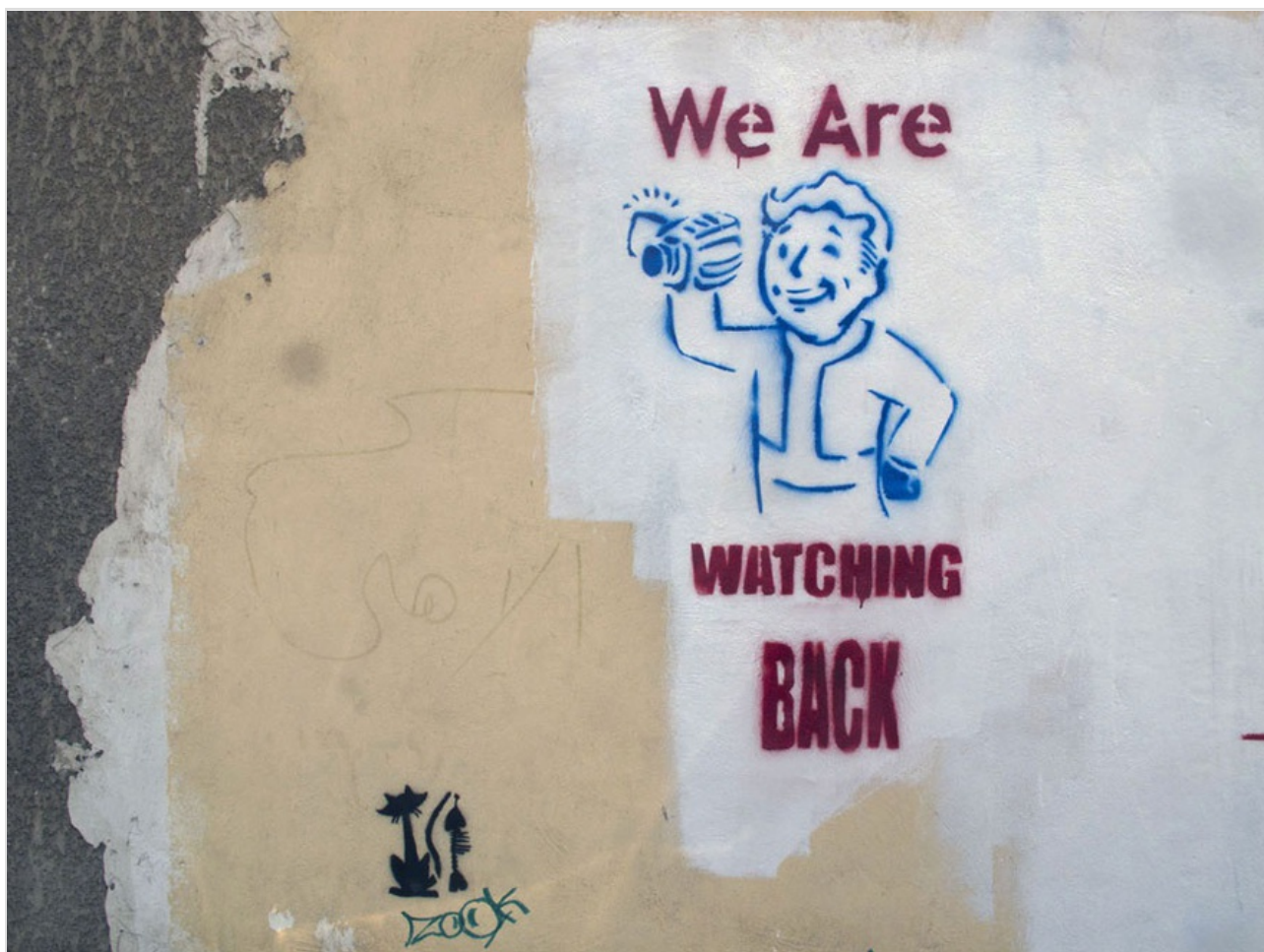
Graffiti by Keizer, Cairo, Egypt, 2011.

The fear that the vision born in Tahrir would die soon after the 18 days may have been another reason why, after Mubarak stepped down and when the army attacked protesters in Tahrir on 9 March 2011, archiving took on a new meaning and urgency. Street artist Keizer's [7] graffiti of a half camera, half gun and a man filming with the slogan 'We Are Watching You Back', represented a whole new movement countering the national media propaganda. Archiving initiatives along with ongoing documentation of Tahrir became a weapon in the battle for the square, for hearts and minds and ultimately the battle for Egypt.