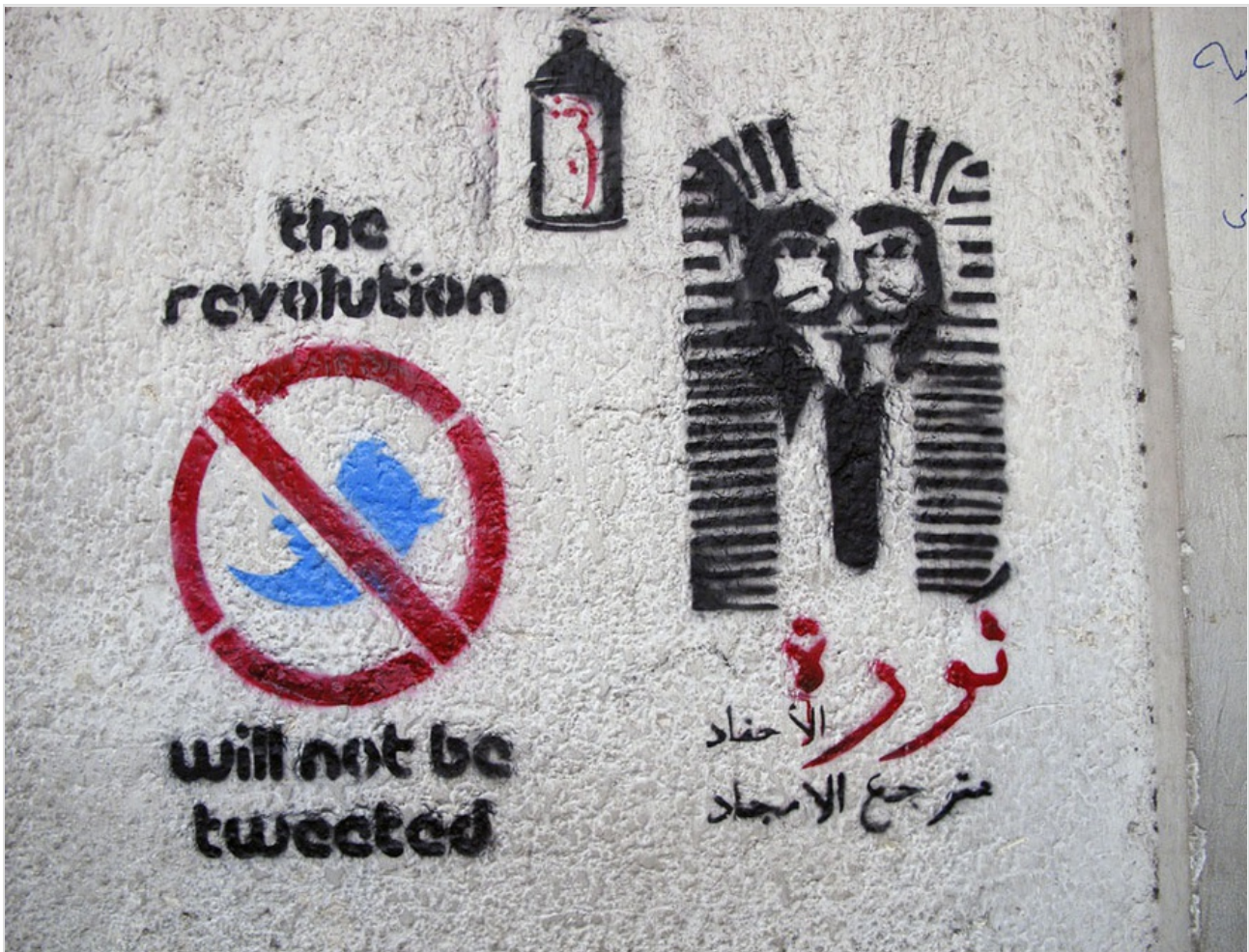
Tahrir Square, Cairo, Egypt, June 2011.

Ten years later, with virtual access to the rest of the world, Egyptian online activists surfaced, preparing the terrain for what would later transform the Middle East and the world at large. By 2006, the Egyptian blogosphere had become the largest in the region, and the World Wide Web an alternative space for political opposition and resistance. On 6 April 2008, textile mill workers organized alongside Egyptian activists using Facebook, blogs, text messaging, independent media and word-of-mouth, strikes and protests known as the Mahalla Factory Protests throughout the country. The 6th April movement - which was created following these events, later played a major role during the 2011 uprisings. Egyptian activist Hossam el-Hamalawy, blogged: 'the revolution will be flickrised,' pointing to the need to document and disseminate the regime's repressive procedures, concealed persistently for 30 years. This was never truer than during those 18 days. The 2011 Arab uprisings, and in particular Tahrir Square – whether seen as a failed set of political revolutions or revolutions still in progress – undoubtedly marked a turning point in history.