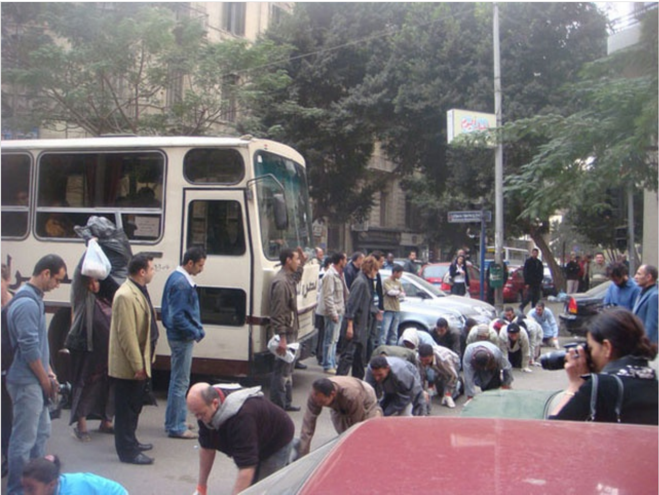
Amal Kenawy, Silence of the Lambs . Street performance, Cairo, Egypt, 2009.

Freed from censorship and from the near-impossible task to obtain official authorizations, artists quickly took over the public space. Street graffiti art, videos, films and other self-produced media expressions, were not political art as we knew it, but a form of 'activism' – art as a weapon against the oppressing state that seeks to confront and reject the political system in place, and by extension the contemporary art market as well. The walls on Mohamed Mahmoud, for instance – a street off Tahrir that witnessed several violent battles between security forces and protesters, became a landmark for revolutionary graffiti. The slogan 'Erase and I will draw again' was a response by revolutionary artists to the systematic attempt by the army to delete every trace of the revolution. The army painted the walls white. The artists drew new graffiti. The multi-layered walls in Mohamed Mahmoud functioned as a much-visited memorial for martyrs, a sort of Guernica of the Egyptian revolution and a public space for revolutionaries' freedom of speech.