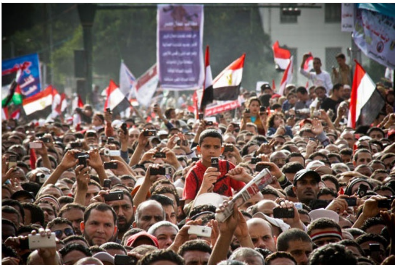
Protesters during a speech in Tahrir Square, Cairo, Egypt, April 8, 2011.

Today, Tahrir Square stands as one of the most documented and mediatized events in the digital age. The challenges of remembering this unprecedented moment in Egyptian history and archiving such an extensive document – that is, an extraordinary and unedited portrait of Egyptians in Tahrir Square one can find online, and/or similar historical events in the digital age – are not only linked to oppressive political contexts. The very nature of the documentation of this movement is intrinsically problematic. In spite of the age of big data and mass connectivity we live in, relying on the Internet is precarious. Even though in theory data related to the 18 days exists online, in reality most of it has already vanished into the Internet's bottomless pit of information.