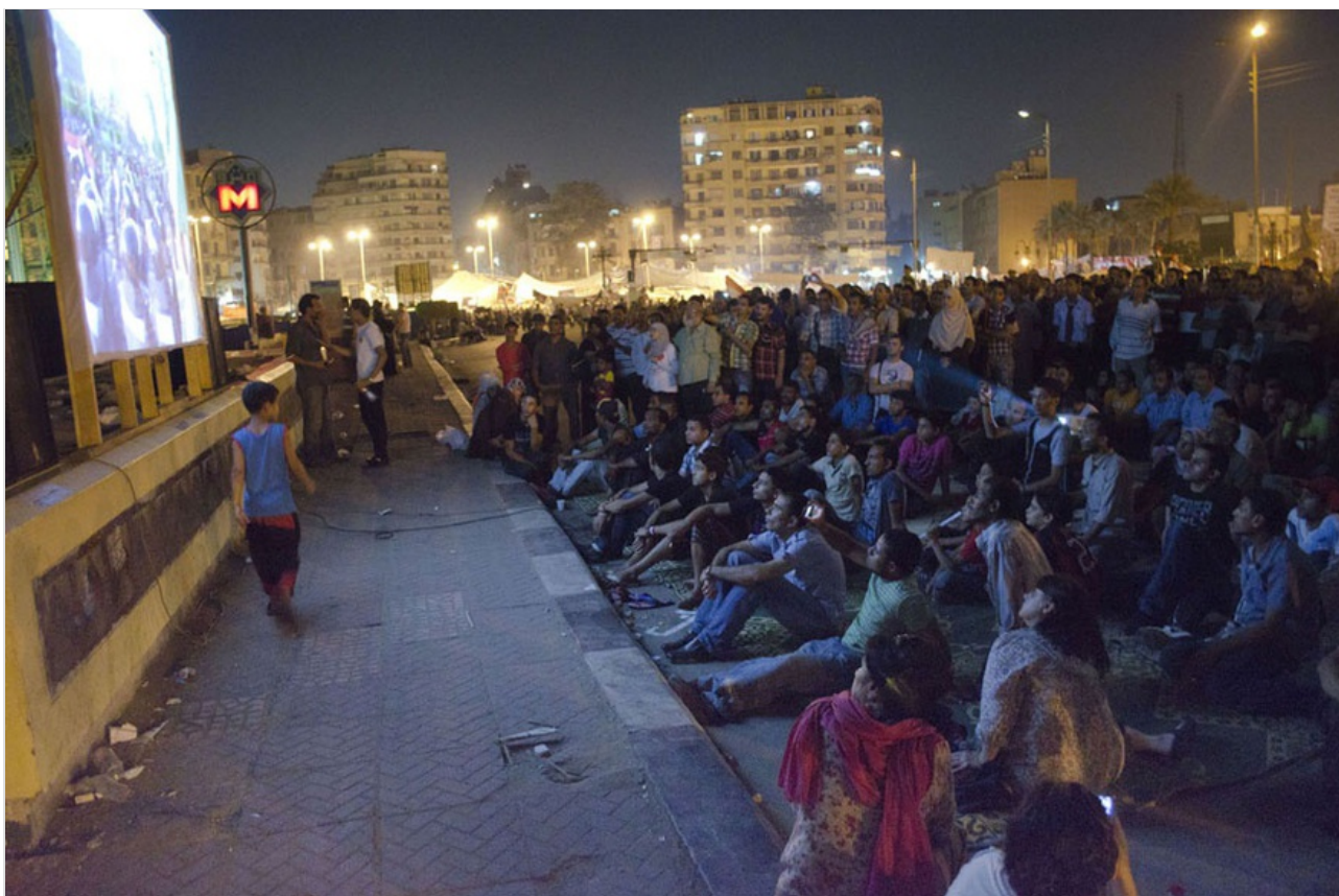
Tahrir Cinema, Tahrir square, Cairo, Egypt, July sit-in 2011.

At the entrance of the square, day by day, by the Kasr El Nil Bridge, we projected a programme of films on a makeshift screen to a rapt audience seated on the ground,. It was an immediate success. We showed video clips from the ongoing revolution, recalling and reflecting on the events unfolding since January, not only in Cairo, but also in Alexandria, Mahalla, the Canal cities, among others. Suez in particular fought hard and a lot of blood was shed. Journalists from Al Masry El Youm , filmmakers, artists and citizens alike shared their experiences on filming the revolution. Activists of the No To Military Trials campaign screened testimonies of the violence inflicted by the army on civilians. Using USB flash drives, DVDs and other (now obsolete) storage devices, we created a space where filmmakers could show their films but also where everyone could exchange raw footage on the revolution at any point in time in the square.