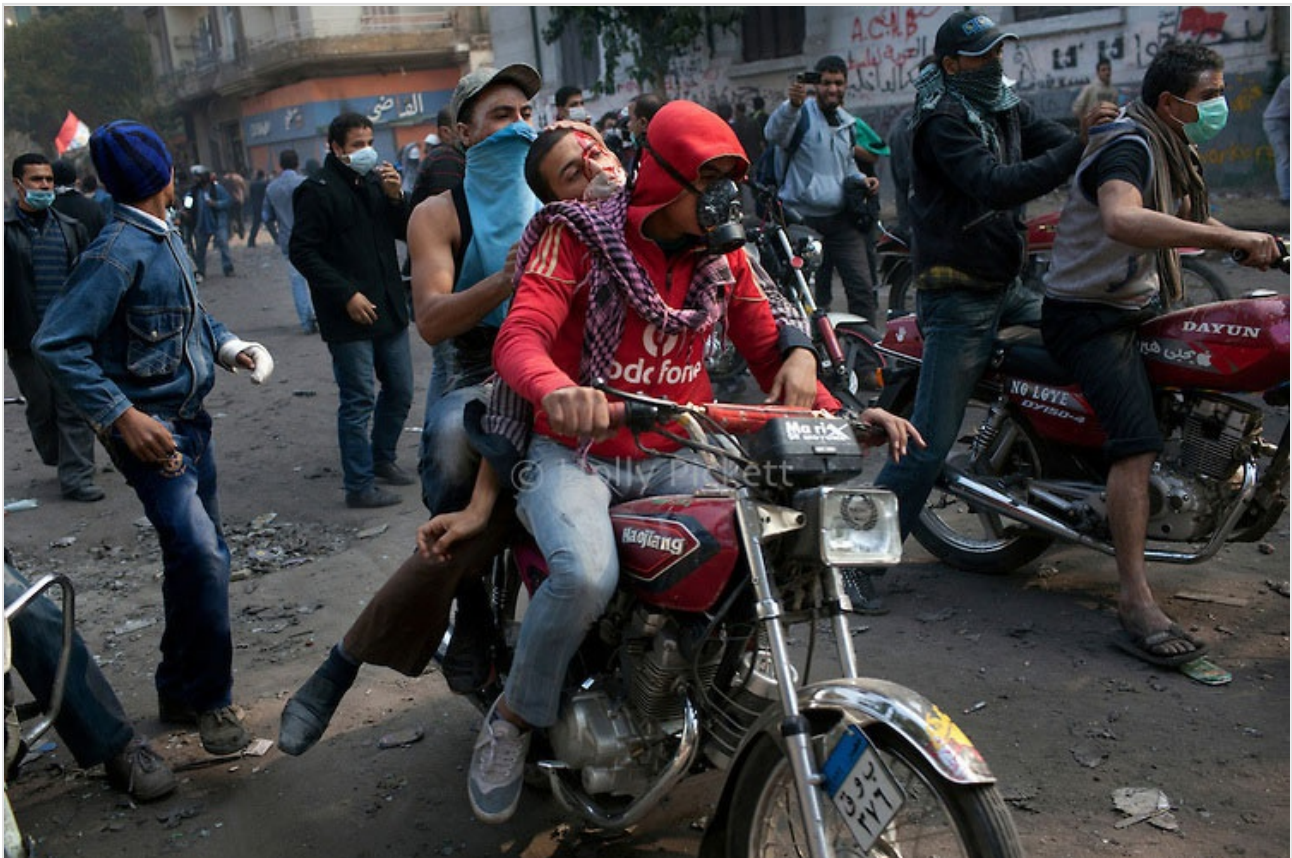
Protesters carry wounded to a field hospital near Tahrir square, Cairo, Egypt, 2011.

the thickness of the air, the cotton candy man, true to form, was selling his pink cloud, tracing his way through the crowd. Standing on the saniyya , (the 'centre of the square' or 'tray' in colloquial Arabic,) groups of people were talking, held in suspense. As I stood there also discussing the outcome of the revolution and witnessing people lose their lives, a biblical scene appeared before my eyes – time slowed down. A sea of people parted to let three men on a motorcycle drive through. The man riding at the back was carrying a wounded sheikh (an Islamic cleric.) He looked like a contemporary version of Mary – as she is often depicted in Coptic illustrations of the Flight to Egypt, majestically holding Jesus in her arms, traveling behind Joseph on a donkey. Maybe this scene is distorted today in my memory, maybe I have omitted important details. But, whatever remains of it, my story of an instant in Tahrir is only a small part of the greater story of the revolution, an unprecedented period in history millions of people experienced.