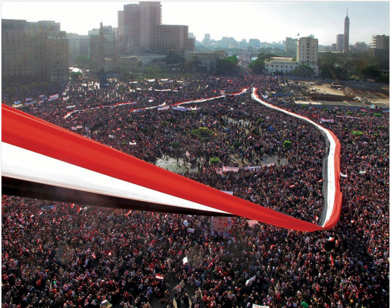
Friday of Victory, Tahrir Square, Cairo, Egypt, February 2011.