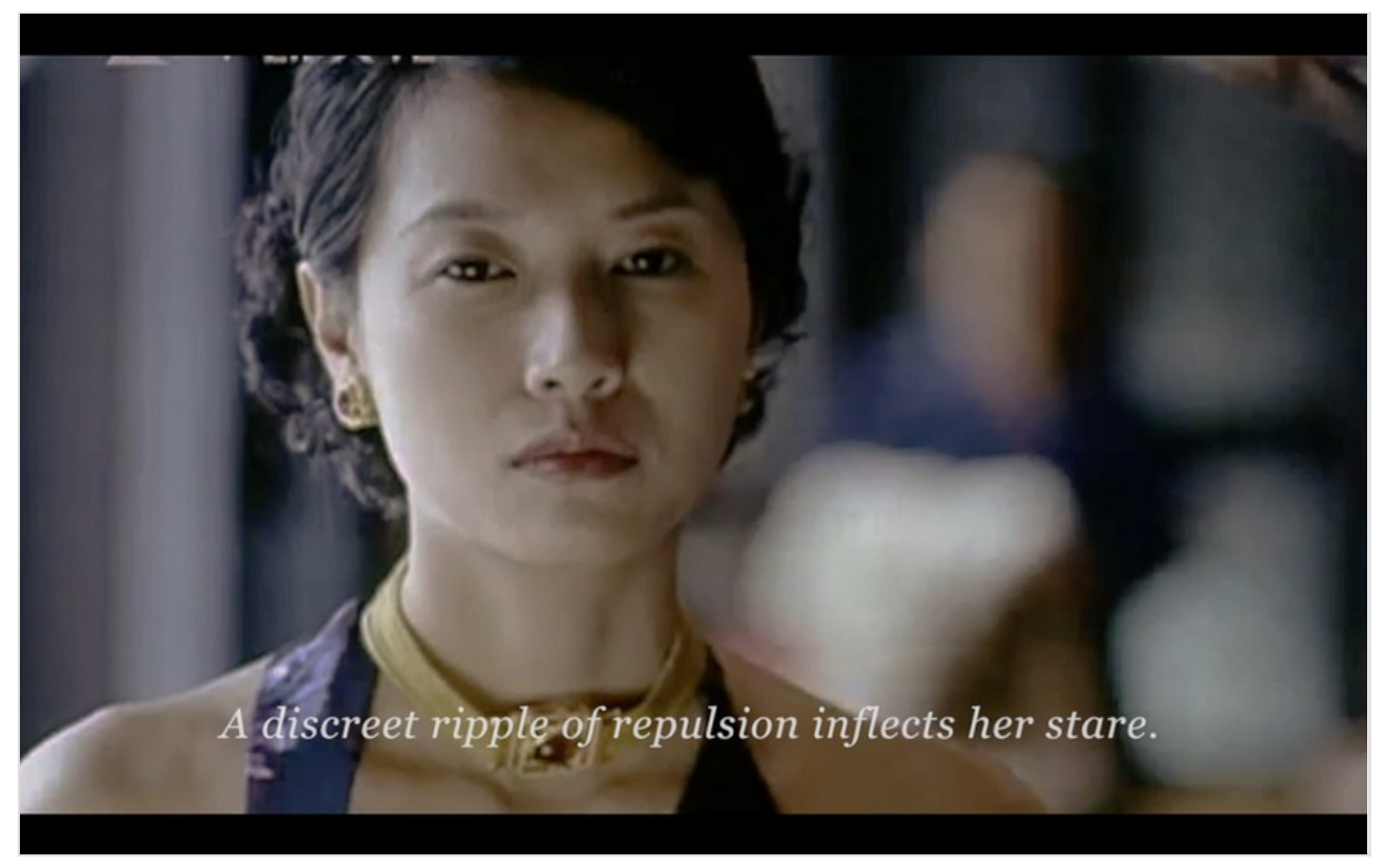
Still from Body Language Subtitles, 2015. Video 3:29min.

He mentions that although photography can be discussed through a broad range of disciplinary lenses in academia – be they sociological, historical or technical – the most basic relationship we have with a photograph is how it personally affects us. When we look at photographs, our affective responses range from average to intense. Barthes refers to the former as studium , which produces an 'average affect', while the latter as punctum , a sudden 'accident which pricks me (but also bruises me, is poignant to me)' and is provoked by a small detail, its occurrence varying from person to person.[6]