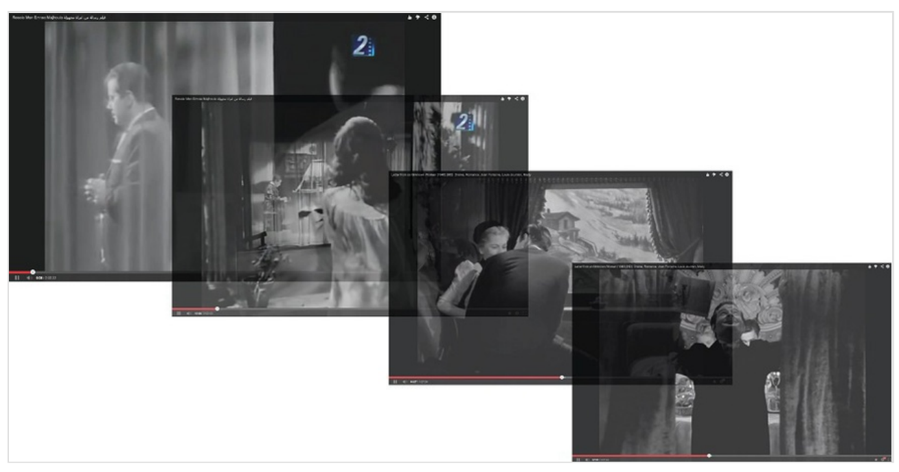
Instances of curtains in Letter from an Unknown Woman .

relationship to Arabic was aural and colloquial, I knew the film would fit the academic assignment but would require an unusual process. Rather than translating words from one language to another based on written literacy, I would translate my aural and visual experience of the film.