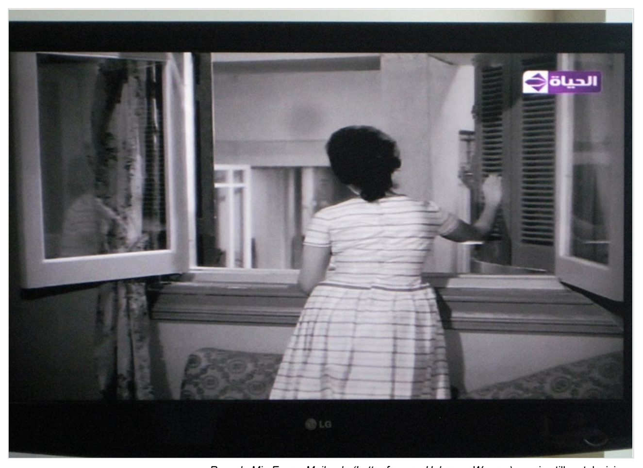
Ressala Min Emraa Majhoula (Letter from an Unknown Woman), movie still on television.

However, the occurrence was significant despite its slightness. It influenced a curve in the trajectory of a Masters project I was working on about Abu Seif's musical film for which 'Azab' was written. Until that point, I had not really considered the role of music in the film's central love story. This was an oversight, of course, but it wasn't until I became aware of what I was avoiding that I could reach this moment of self-reflection. It caused me to question my subjectivity; something I was already consciously doing as part of my research. At the time, I was considering how the subjective experience guides the way we read, relate to, and make provisional connections with the objects we encounter in the world. Thus, in looking at the film, I wanted to see how I could use myself as a research probe to reflect on and inspect the series of encounters I had with Letter from an Unknown Woman over the course of five years. The more I watched, read and listened, the more aware I became of my own performance as both a spectator and subject of my inquiry.