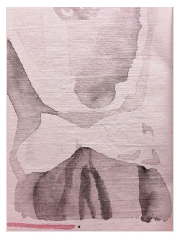
The Ribbon, 2015. Watercolour.

European cities through the use of technology. To begin thinking about the kinds of technologies that would meet this objective, the designers selected a group of volunteers and observed their personal experiences with technology in their homes. The designers provided the participants with a 'probe packet' that included instructions and items. such as a household routine work pad, a digital memo taker for recounting dreams, and a disposable camera. The intention in selecting these objects was to tap into the curiosities, hopes and dreams of the participants by offering a playful way of extracting information. Each object encouraged participants to engage and reflect intimately, and to a certain degree spontaneously, on various aspects of their life and routine. Whether through writing, speaking, drawing or photography, the content the probes generated would in turn provide the designers subjective maps of each person's singular lifestyle.