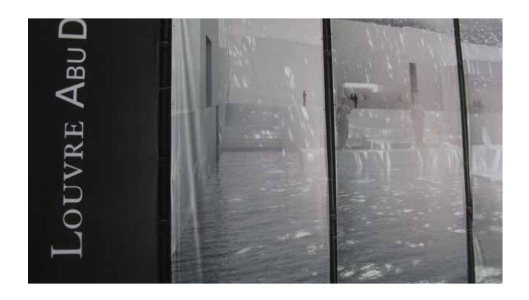
Gregory Sholette, Saadiyat Island.