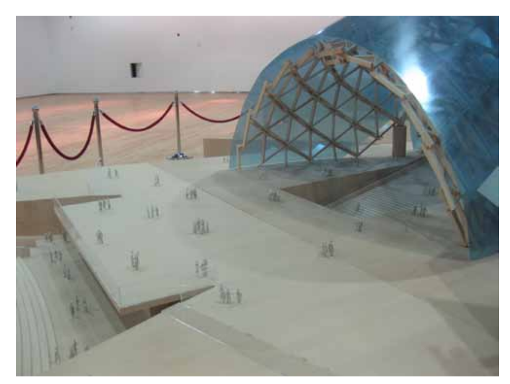
Gregory Sholette, Saadiyat Island.

movement put the same pressure on globalising corporations. That campaign to promote fair labour has had mixed results: capitalist enterprises are ruthless in their exploitation of offshore labor. We should expect more from non-profit art world institutions, and this is something we have argued consistently to our Guggenheim contacts.