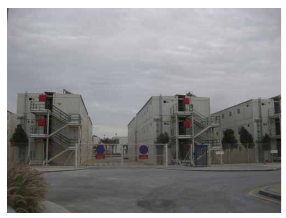
Impact of the 'Arab Spring'

Gregory Sholette, Saadiyat Island.