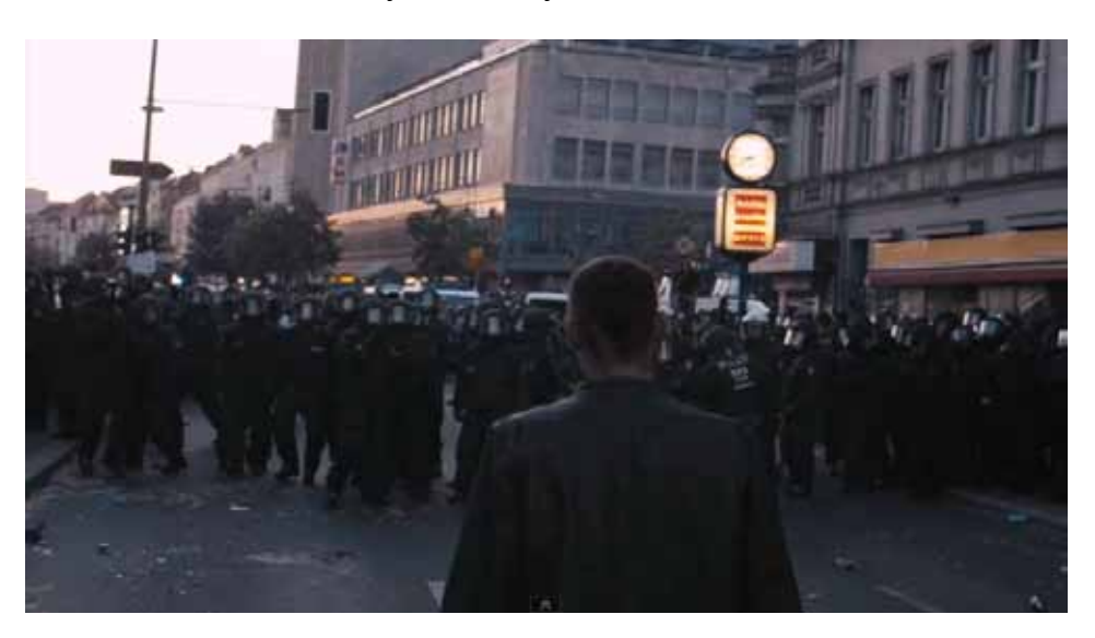
Still from Legacy for Levi's advertising campaign Go Forth! by Ralf Schmerberg, 2011. Courtesy of the artist.

At the same time, the material characteristics of civic and amateur reportage have long since been adopted into the language of other fields of aesthetic practice. Inconsistent framing, handheld camera and pixelation, to name just a few formal aspects, are now common stylistic elements in mainstream cinema, advertising and contemporary art. The accuracy of images with regards to their origin and intent has been blurred, and with this comes an immediate impulse to trust their superficial appearance. We feel reminded of Walter Benjamin's notion of aura, with which he describes the quality of artworks to produce a strange web of space and time; a distance, as close as it can be. [5] For Benjamin, this aura was in imminent danger of being destroyed by the technological progress of film and photography-based media, causing a shift that would strongly affect the social function of media at large. Today's image production and reproduction have reached dimensions that would have exceeded Benjamin's imagination at the time. Reading Benjamin slightly against the grain of his intention today, one could see in citizen journalism and its manifold facets a strange web of proximity and distance that is again at risk of being undermined by technological advancement – or its wrong application. Whether or not these concerns should outweigh the social and political agency of the imagery itself is evidently a complex issue.