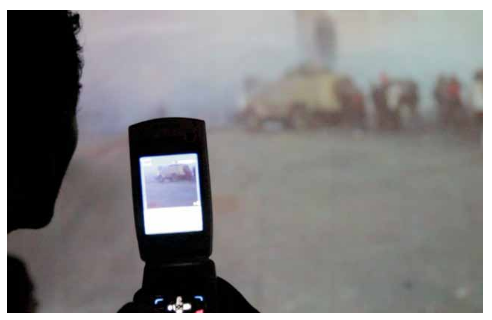
Mosireen Collective, Cairo, 2011.