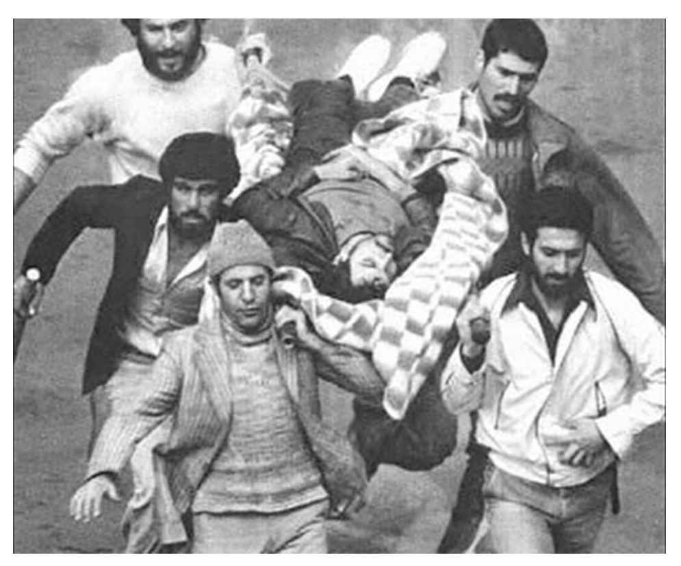
Silent Collective, The Silent Majority Speaks, 2010, film still.

picture book that loosely lumps together clouds of visual material without clear equation between frames of reference or origin, from the Iranian Green Movement and the various uprisings within the Arab world via protesters at the periphery of the Eurozone to different Occupy movements spreading around the globe.